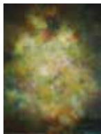
BG04 Brown Tones