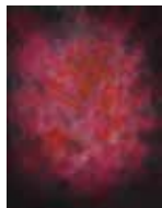
BG11 Royal Red