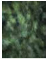
BG07 Green Tones