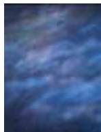
BG03 Blue Tones