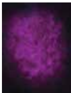
BG10 Purple Prose