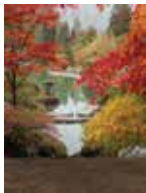
BG06 Fall Garden